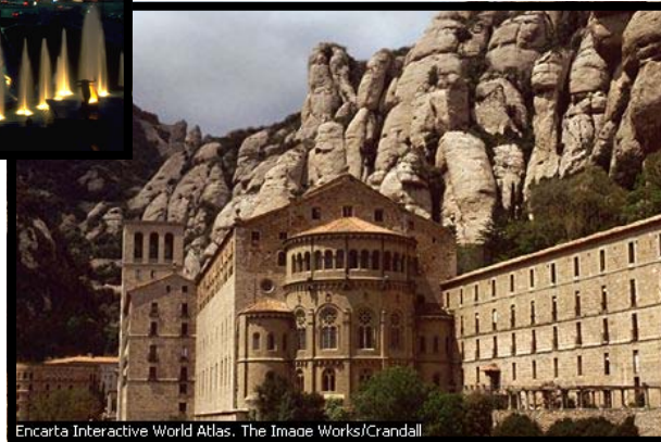
Encarta Interactive World Atlas, The Image Works/Crandall

Jet home with memories of your excellent adventures, from Paris to Madrid.