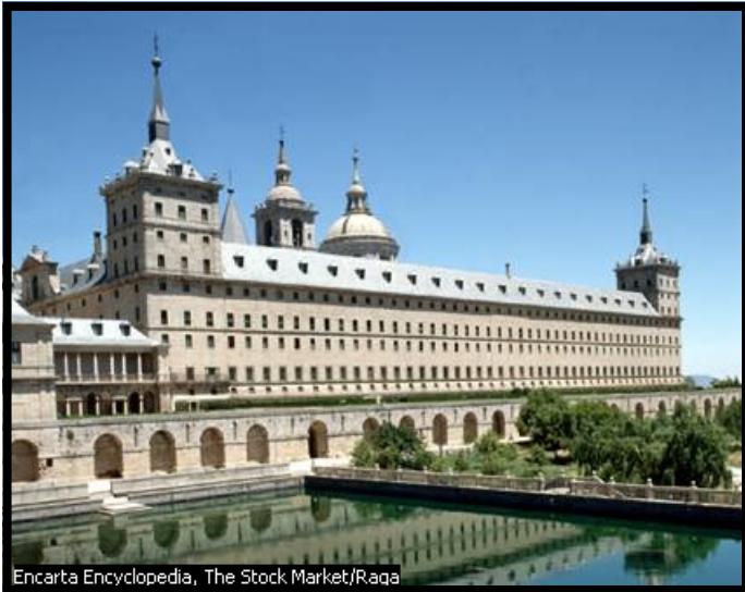
Encarta Encyclopedia, The Stock Market/Raga

OPTIONS: Flamenco Performance • Picasso Museum