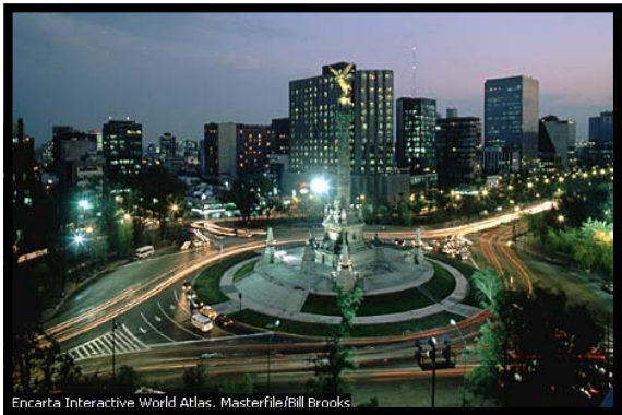
Encarta Interactive World Atlas.

HIGHLIGHTS: Mexico City Tour • Chapultepec Park • Museum of Anthropology • Full Day Shrine of Guadalupe and Teotihuacan Pyramids • Mitla • Monte Alban • Oaxaca Crafts Workshop • Puebla City Tour • Cholula