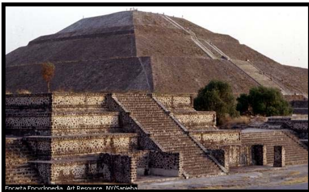
Encarta Encyclopedía. Art Resource. NYSanishal

DAY 2 MEXICO CITY Discover the heart of México City on a City Tour . You'll see the Zócalo, the main plaza which was the former site of the Aztec capital; the National Palace, built by Hernan Cortes in 1523 and home of the President; and the Grand Courtyard with the fabulous frescoes painted by Diego Rivera. These murals depict scenes from Mexican history and cover over 4,850 square feet. Then on to Chapultepec Park to see Chapultepec Castle and the botanical gardens. Later, visit the Museum of Anthropology to view its treasures of Indian art.