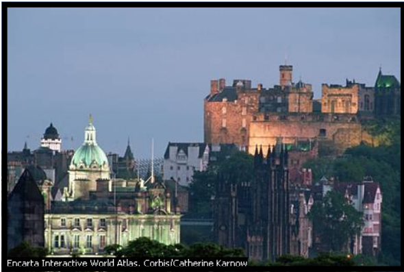
Encarta Interactive World Atlas. Corbis/Catherine Karnow

OPTIONS: London Theatre Performance • Bateaux Mouche