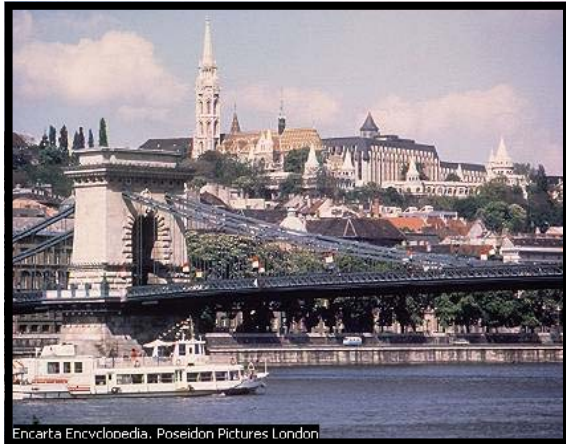
Encarta Encyclopedia, Poseidon Pictures London

OPTIONS: Esztergom Tour • Hungarian Folklore Dinner • Schönbrunn Palace