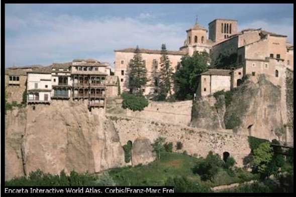
Encarta Interactive World Atlas, Corbis/Franz-Marc Frei

DAY 1 Board your flight, bound for Spain.